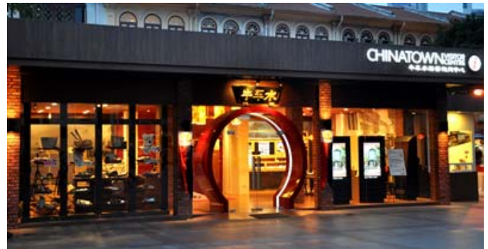
Some examples of Jesvin's work

These have been featured in local and overseas media, and exhibited in Australia, Hong Kong, London, South Africa and Denmark.