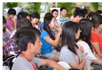
Interacting with students at talks and specially designed lectures

Scholarship interviews, incidentally, is an excellent way to reach out to the good students. I urge all colleagues who are involved in this exercise to take pride in sharing about the best aspects of our programmes. It is important to highlight that HASS students have access to a rich array of courses in all three Schools and the balance of breadth and depth in our approach to learning.