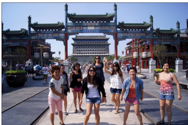
Summer School students in Tianjin City, China, July 2012

Following the success of the Summer School in 2012, there has been increasing demand for HASS to significantly expand the programme and accept new partner universities for summer 2013.