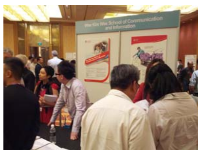
Engaging students at NTU Let's Talk NTU 2013, on 26 January 2013

Scholarship interviews, incidentally, is an excellent way to reach out to the good students. I urge all colleagues who are involved in this exercise to take pride in sharing about the best aspects of our programmes. It is important to highlight that HASS students have access to a rich array of courses in all three Schools and the balance of breadth and depth in our approach to learning.